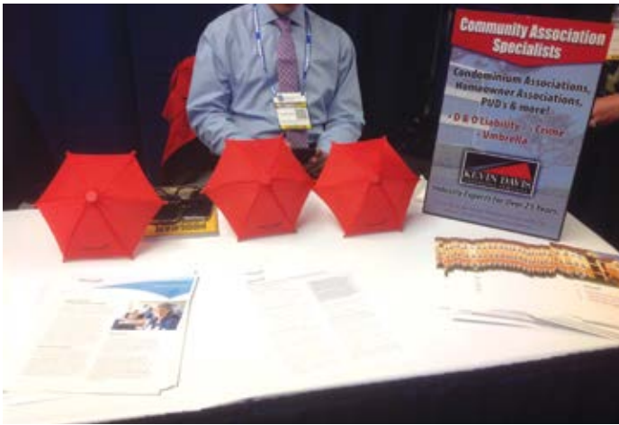
14. Travelers: It's smart retailing to use props specifically associated with your company, i.e., the Travelers umbrella. In this case, the miniature umbrella was a device to attract attention and reward attendees for speaking to a Travelers representative.