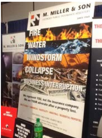
16. M. Miller & Son: A picture is worth a thousand words. This exhibit used only four words. Supported by powerful and appropriate graphics, each image communicated the value of its services to the target audience.