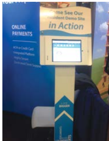
17. PayLease: Got a demo and want attendees to join in? Make it easy for them to participate with displays that integrate the activity and signage with a call to action describing the process and what they will learn as a result. PayLease made it easy to participate with its specially-designed information stations.