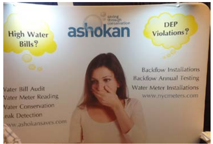
15. Ashokan: Clean billboard style graphics used two strategically placed highlighted text bubbles to identify problems. The solutions were supported by an image of a woman in a quandary and the exhibit demonstrated how a customer might respond to such problems.