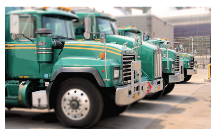
PRINTED BY UNITED METRO ENERGY CORP. ALL RIGHTS RESERVED. SS-AU-814