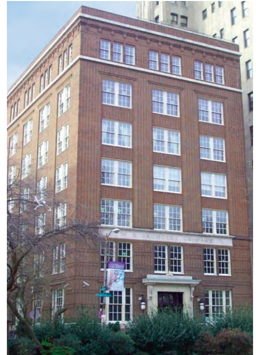
HISTORICAL WASHINGTON SQUARE