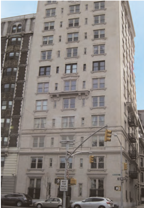
350 RIVERSIDE DRIVE