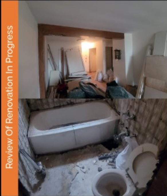
Review Of Renovation In Progress

This private review shall not be confused with the mandatory DOB plan review conducted by a plan examiner during review of the construction documents (drawings and forms) filed by the Architect of Record for a renovation project. Our review is coordinated with the tenant/shareholders professional of record so the aesthetic elements of the plans, costs and feasibility of its construction are not affected. M+S Further reviews the proposed work to ensure that it complies with the regulations of the Alteration Agreements, the requirements of the DOB and LPC, and any other agencies having jurisdiction.