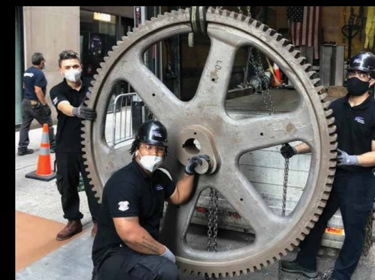
Experience others can only try to duplicate.