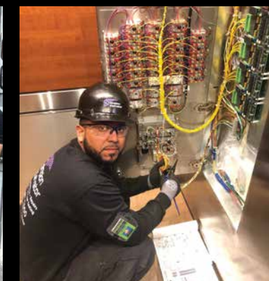
We never turn our back on your job.

All controls installed by Champion are non-proprietary and can be re-programmed to meet your building's ever-changing needs.